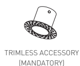
TRIMLESS ACCESSORY (MANDATORY)