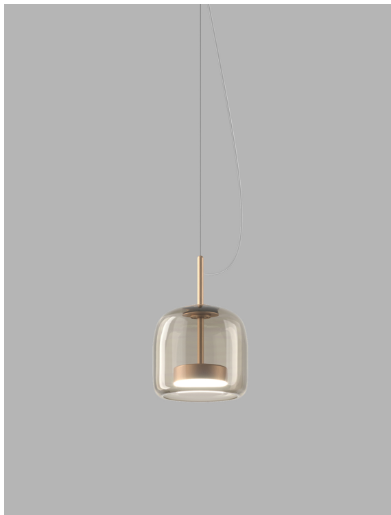
JUBE SP 1 P FUTR OS L22 02 CE

AATR light amethyst transparent CRTR crystal transparent FUTR smoky transparent TBTR burned earth transparent VATR old green transparent