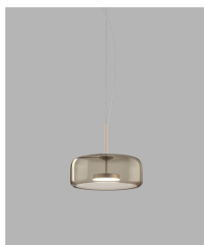
JUBE SP 1 G